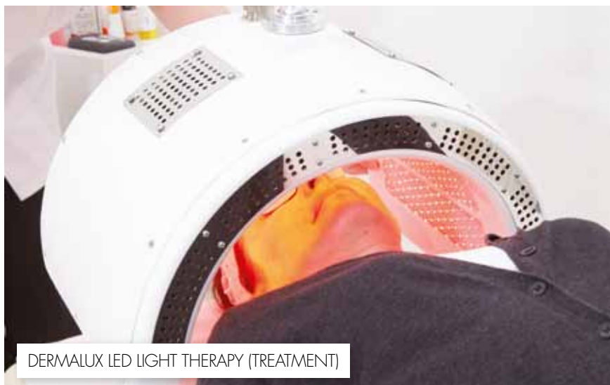
DERMALUX LED LIGHT THERAPY (TREATMENT)

platform and treatment parameter, 3JUVE addresses not only skin laxity and loss of firmness but also the two other key signs of ageing; discolouration and the appearance of fine lines and wrinkles.”