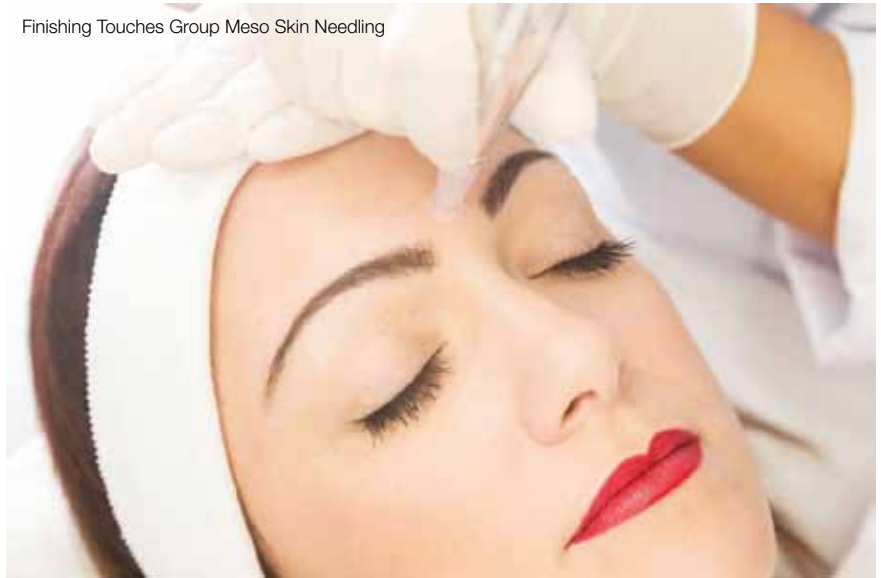
Finishing Touches Group Meso Skin Needling

Meso Me is a 'gentle' skin needling concept using only plastic needles. This treatment is suitable for all skin types, with all redness dissipating within 1-2 hours of