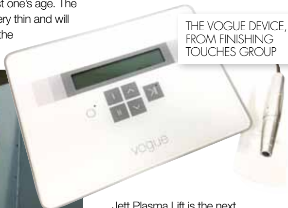
THE VOGUE DEVICE, FROM FINISHING TOUCHES GROUP