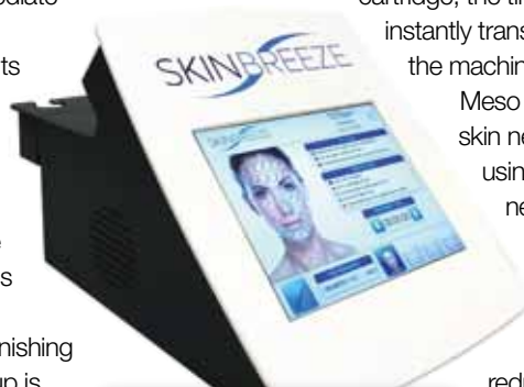
SKINBREEZE NEON PLASMA