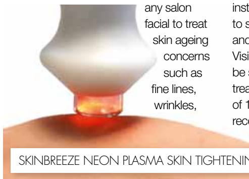
SKINBREEZE NEON PLASMA SKIN TIGHTENING