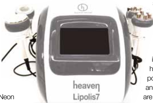
HEAVEN SKINCARE LIPOLIS 7